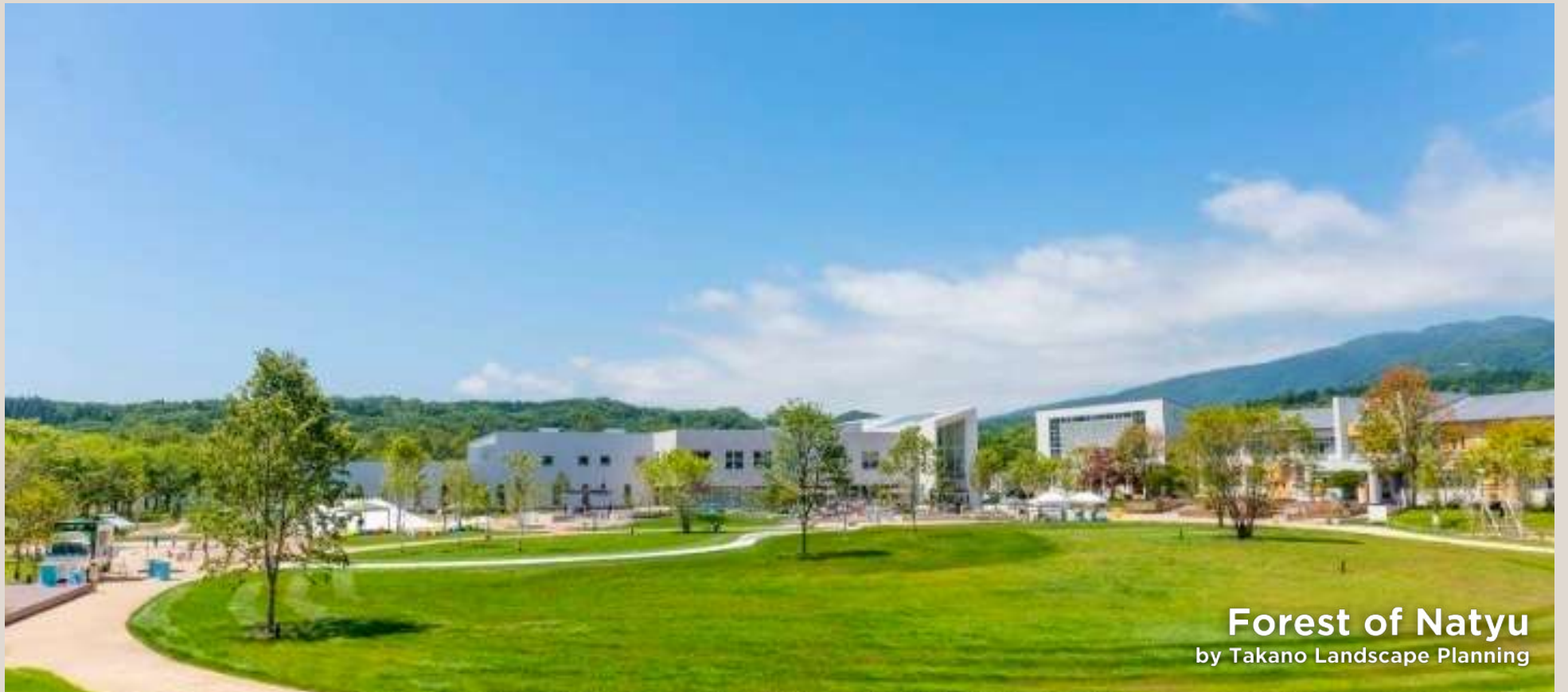
Forest of Natyu by Takano Landscape Planning