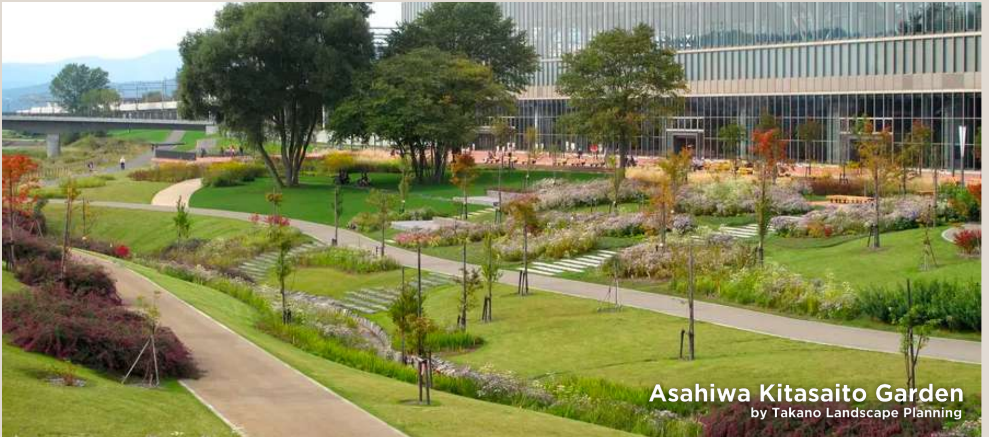
Asahiwa Kitasaito Garden by Takano Landscape Planning