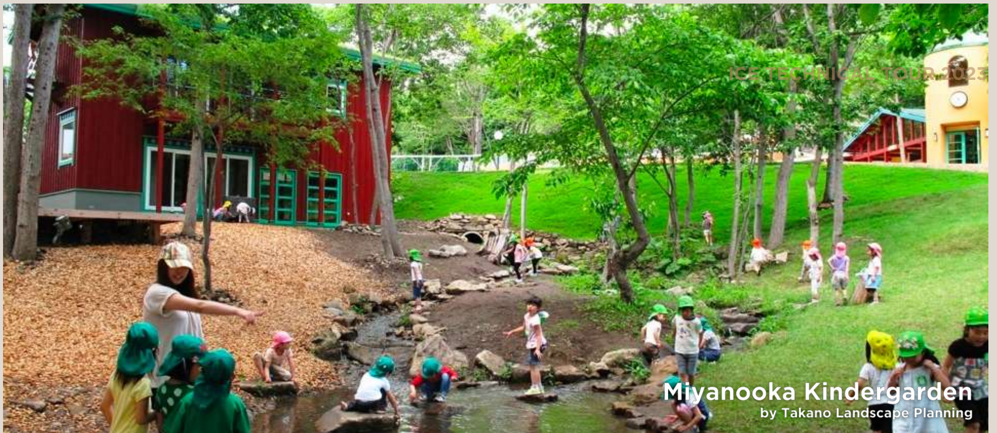
Miyanooka Kindergarden by Takano Landscape Planning